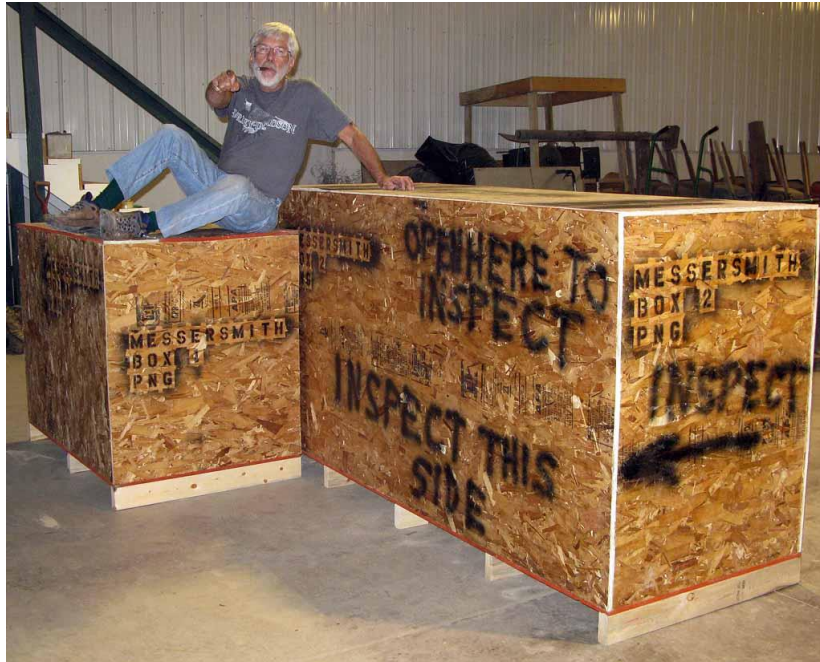
Crating complete and ready for the off!