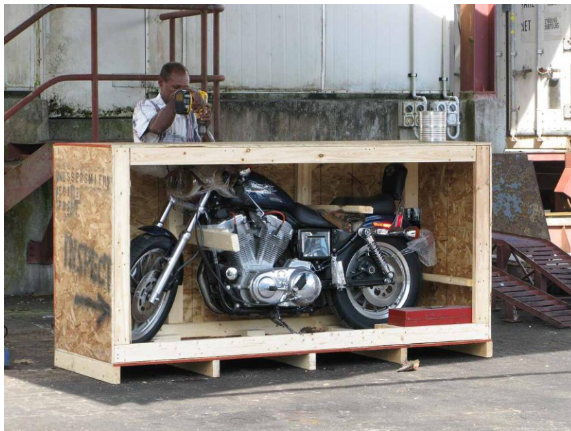
Destination reached, and you'll soon be on the road!